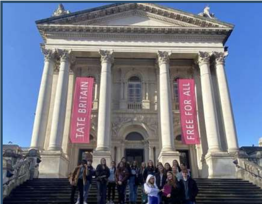
Sixth Form - London